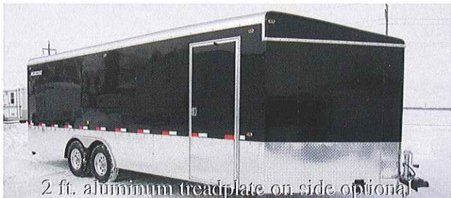
2 ft. aluminum tread plate on side optional