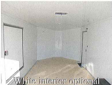
White interior optional